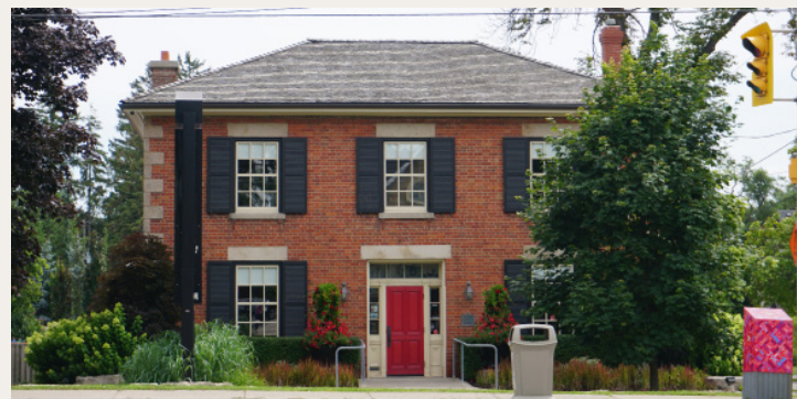
Former St. Peter's Anglican Rectory