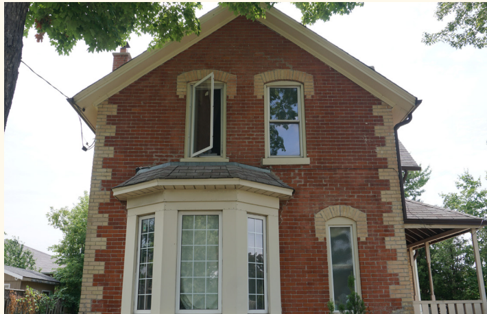
David Tomlinson House