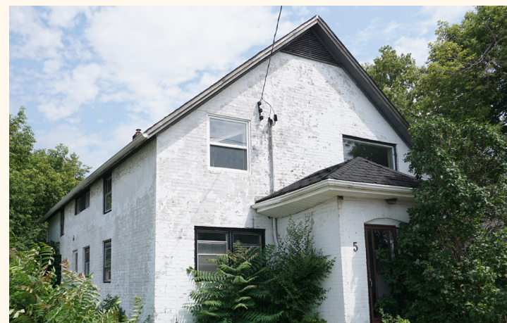
Former Trinity Methodist Church