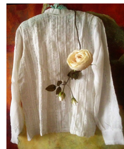
Mom's White Shirt, WDYB

Each personal story, no matter how insignificant it may seem, forms a part of an ever-changing multicultural bridge between what remains as memory of distant and different worlds, and a fresh awakening to a new reality. The stories told through their own narrative leave a lasting legacy. www.whatdidyoubring.ca