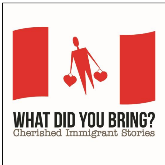
Exhibit Opening: Tuesday, February 20, 2018 As part of Heritage Day at The Grange 2018: 10 am to 8 pm

Heritage Mississauga presents an exciting new exhibit at The Grange February 20 to March 23, 2018